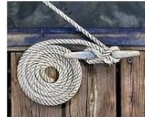
Knots & Line Handling