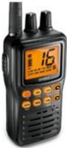
VHF Marine Radio